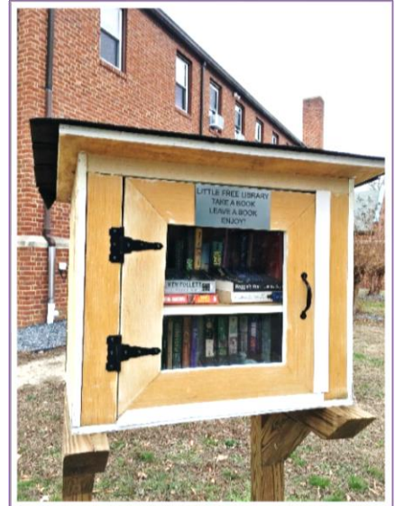
Little Free Library. Donate a book. Leave a book for others.